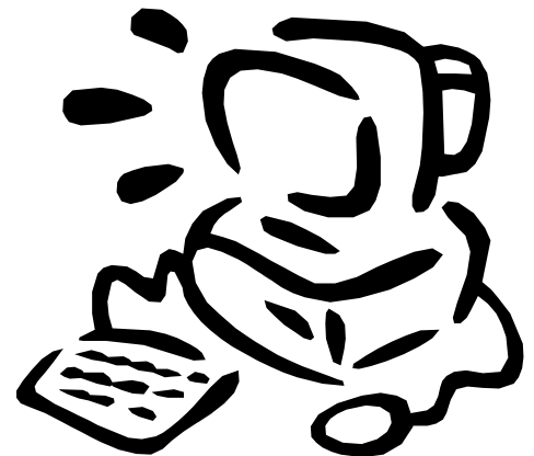
The Practical Application of computers to Amateur Radio

dio that you would like discussed or presented in one of our meetings, please let us know.