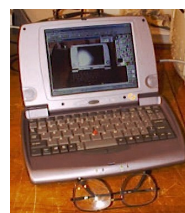
Mini-notebook for mobile amateurs.