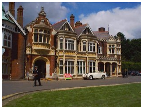
Bletchley Park - June 2000

During my recent visit to the UK I got a chance to visit Bletchley Park. This estate of 58 acres was the decryption centre for the Allied Forces during the Second World War. It was the 'best kept secret of the Second World War' as nobody talked about what went on there after the war for over 30 years. My visit was on a